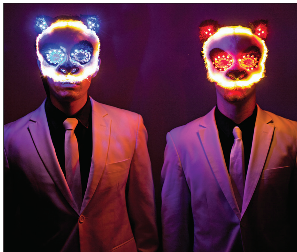
continued on p. 3 The White Panda