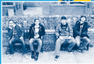
The Lonely Friends 3 – 3:45 p.m.