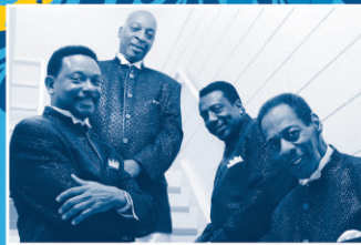
The Contours featuring Sylvester Potts 4:30 – 5:30 p.m.