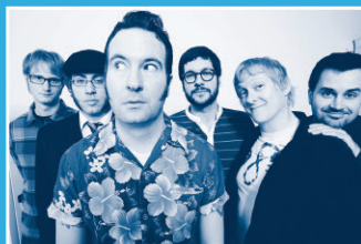
Reel Big Fish 9 – 10 p.m.