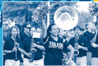
Pep Rally 5:30 – 6 p.m.