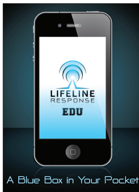
continued on p. 4

There also is a timer mode that can be used for longer periods of time or when you need your hands free. If the application is not disarmed when the timer expires, authorities are contacted.