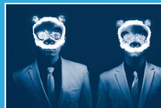
The White Panda 10:30 – 11:30 p.m.

FRIDAY, SEPT. 13 · 3 P.M. TO MIDNIGHT THE UNIVERSITY OF TOLEDO MAIN CAMPUS MEMORIAL FIELD HOUSE LAWN