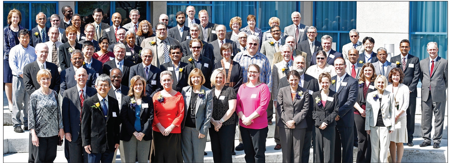
Faculty members who are up for tenure and promotion were honored at a luncheon last month in the Hotel Ballroom and posed for a photo along with their deans and department chairs after the event.