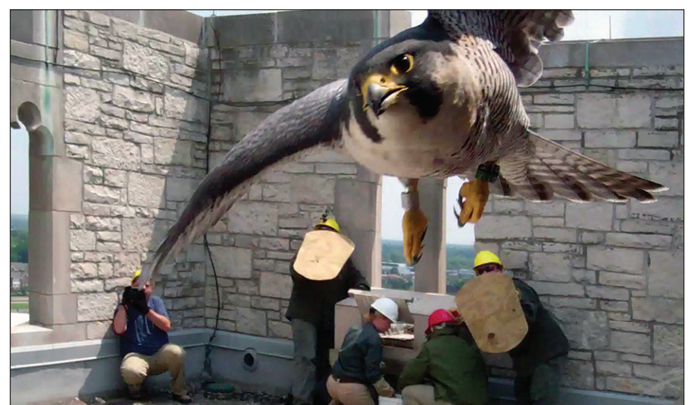
Check out the the UT Fal-Cam to see Belle and Allen and their chicks! Go to http://utole.do/falcam .