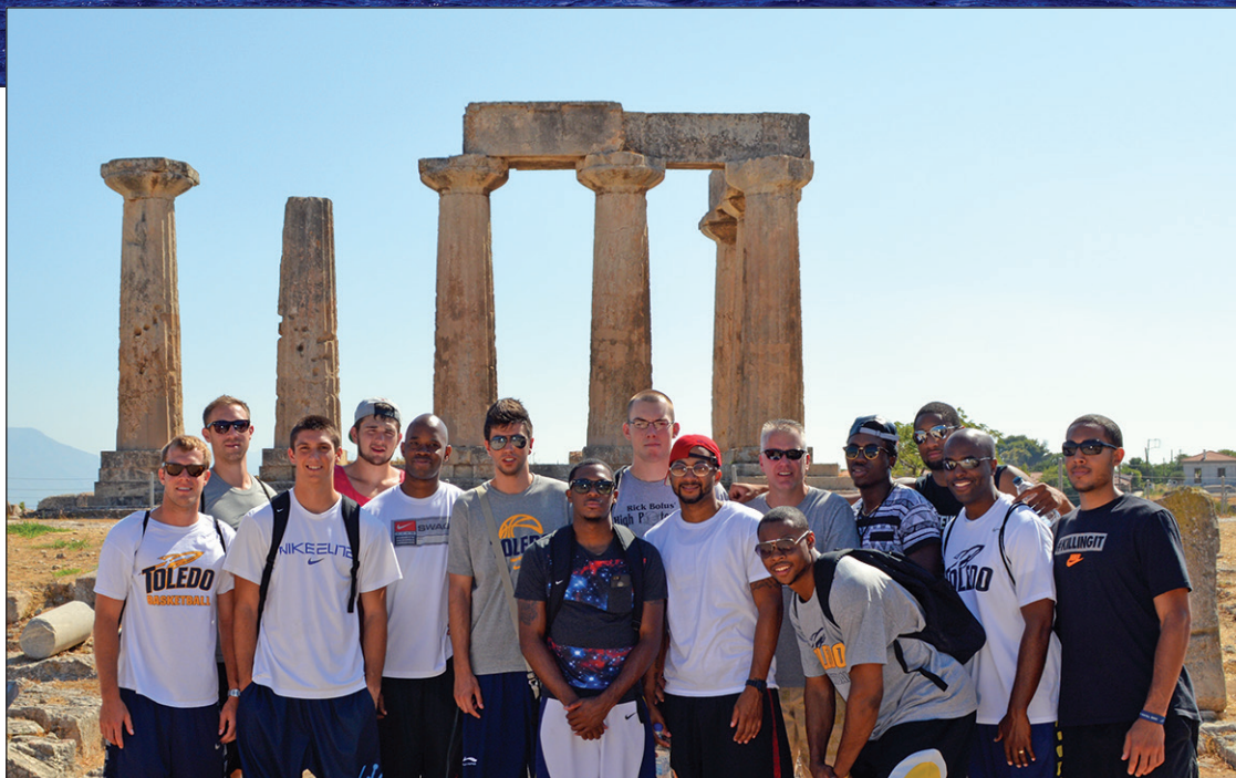
The team visited the Temple of Apollo in Corinth, Greece.