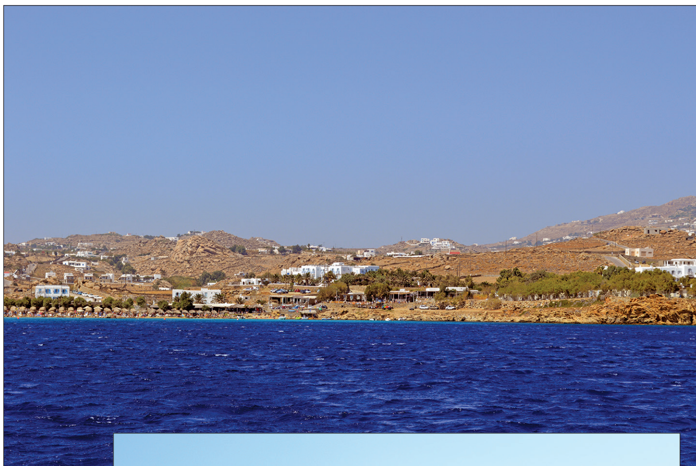
This scenic shot of the Island of Mykonos was taken from a boat on the Aegean Sea.