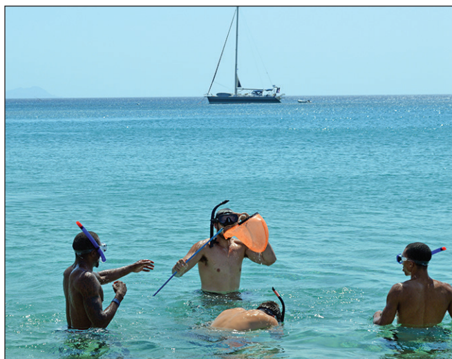
Players snorkeled in the Aegean Sea.