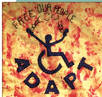
Piecing together the past page 6