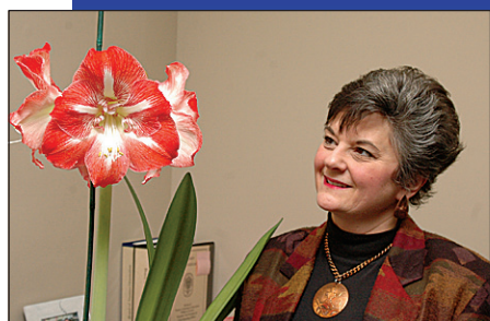
Flower buds page 3

Executive staff members also will be on hand to take questions.