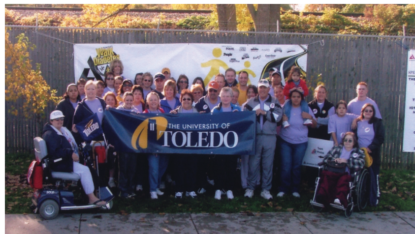
Group shot: UT employees and family and friends posed for a photo after the 2004 Diabetes Walk at the Toledo Zoo. The 48 walkers raised $2,286.