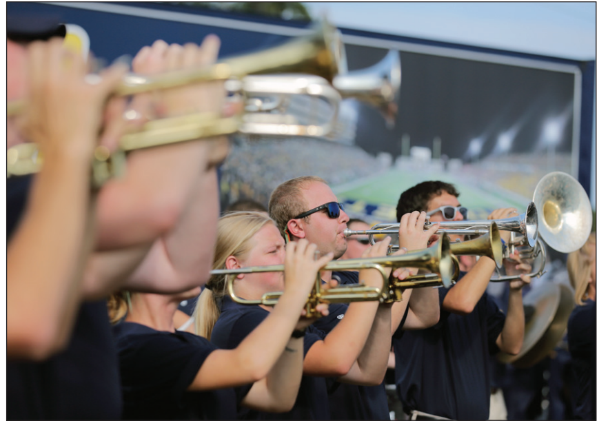
ALL THAT BRASS: Members of the UT Marching Band played during the pep rally.