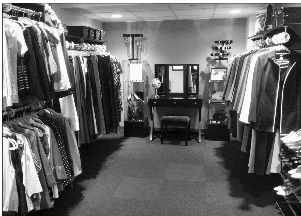
DRESSED FOR SUCCESS: Volunteer style consultants for Kate's Closet are ready for shopping appointments with female UT students. Call 419.530.8570 to set up an appointment.

Class registrations for fall are open, and the schedules are available online at utoledo.edu/centers/eberly ; hard copies also are available at the Eberly Center and across campus.