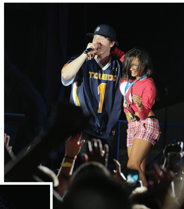
FAN FAVORITE: Mike Posner sported a baseball cap of his hometown team, the Detroit Tigers, donned a UT jersey and delighted a fan, and showed off his splashy percussive skills to close Music Fest.