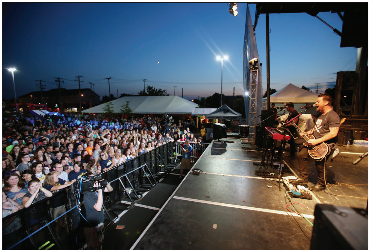
IDOLIZED: David Cook, who won the seventh season of "American Idol," was a crowd-pleaser Friday night, showing off his fret work. Before starting his set, the engaging performer said he wanted to try something with the crowd and yelled, "T-O-L," and fans loudly answered, "E-D-O."