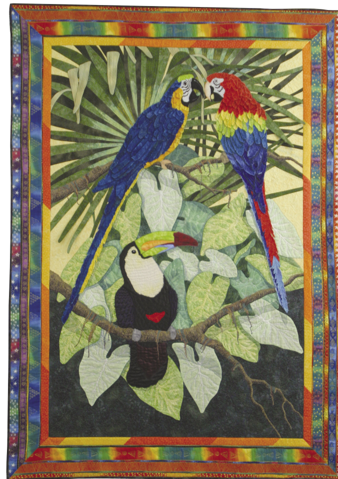
"Gossip" by Ellen Leonard

Detailing the designs can be quite labor-intensive, as well. Leonard pointed