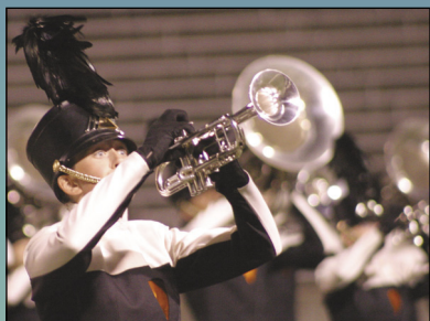
Strike up the band page 5