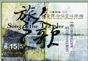
On tour page 7

Look for the next issue of UT News June 27.