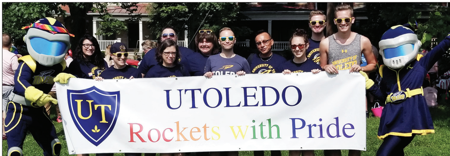
ROCKET PRIDE: A group of UToledo students, employees and alumni participated in the 2018 Columbus Pride Festival. Rocky and Rocksy also were in the state capital for the parade.

Sign up to receive a free UToledo Pride T-shirt while supplies last: Go to webforms.utoledo.edu/form/91260524453 .