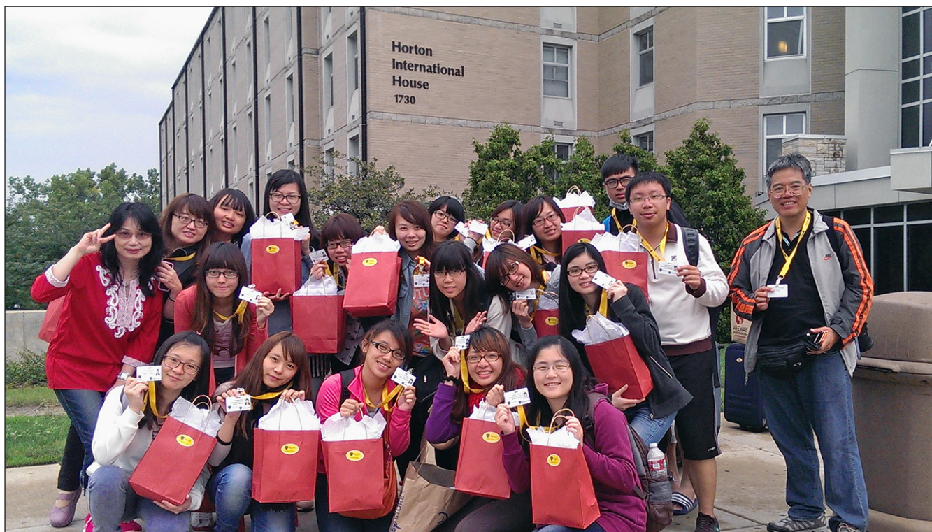
SMILE! Nursing students from HungKuang University in Taiwan posed for a photo after arriving at the University June 30. They are attending the first International Nursing Visitor Program at UT Medical Center to learn about U.S. health care and culture. The program runs through Wednesday, July 10.

Additional information about Women & Philanthropy is available at utoledo.edu/offices/women_philanthropy .