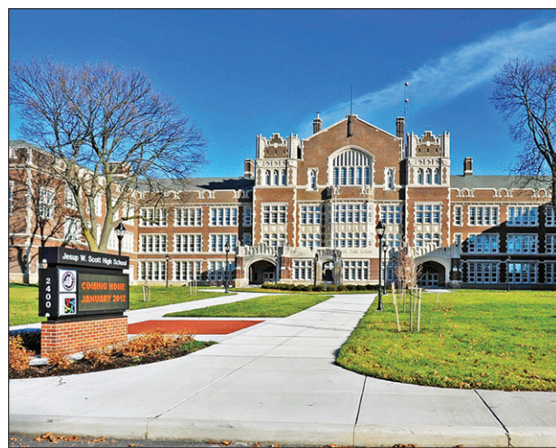
Scott High School