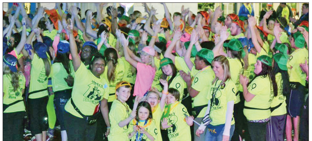
JUST DANCE: Students vlogged for the camera at last year’s RockeTHON.