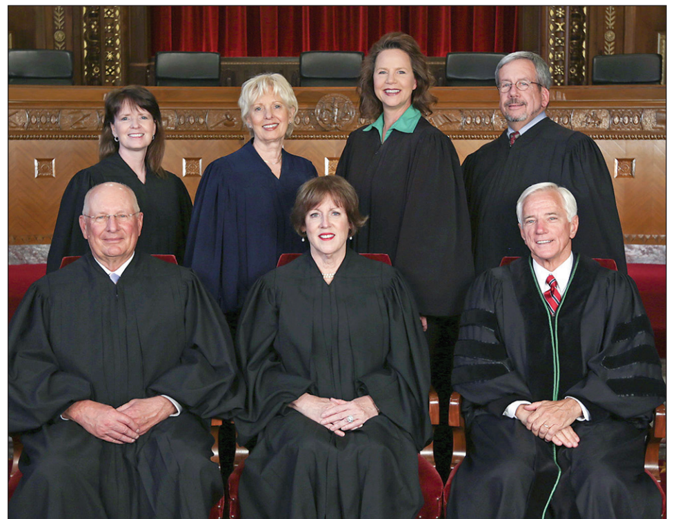
Supreme Court of Ohio Justices