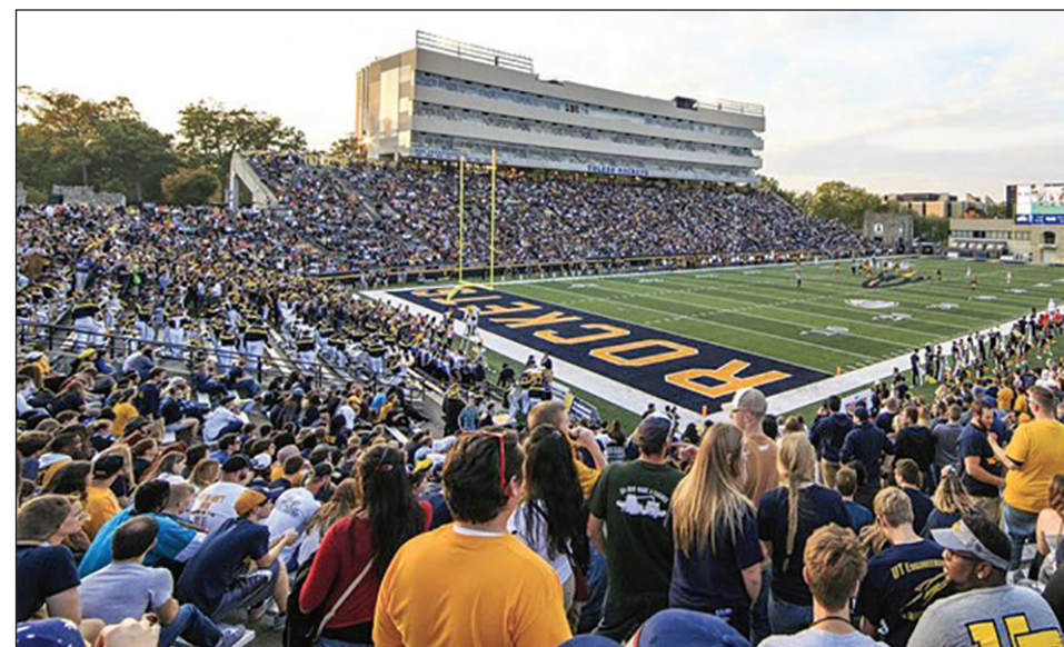
SEE YOU AT THE GAME! An average of 20,745 fans packed the Glass Bowl each game last season.