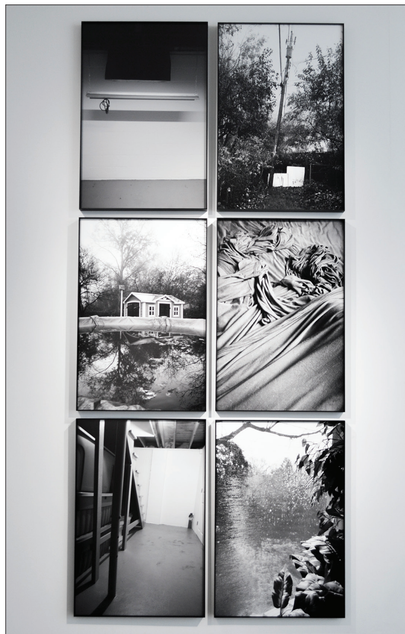
These archival pigment prints by Sebastien Schohn are featured in the BFA Thesis Exhibition.

Tickets will be available at the door, from the UT Center for Performing Arts Box Office, or online at http://utoledo.tix.com/Event.aspx?EventCode=961050 .