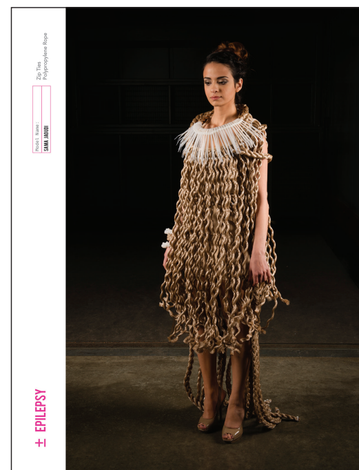
"Epilepsy" by Kayla Perez is from last year's "Wearable Conditions" exhibit.