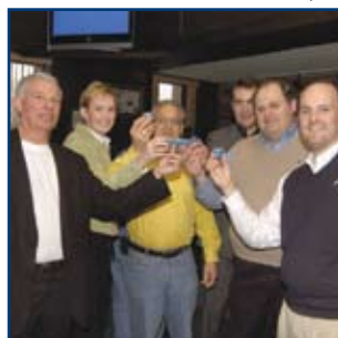
Ready to roll p. 4