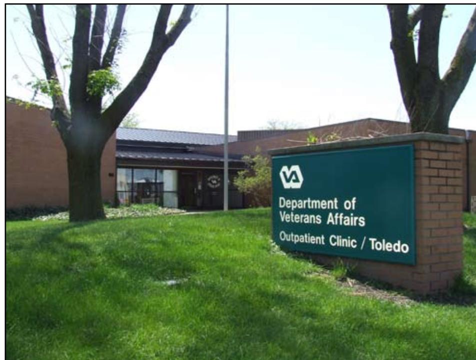
The Department of Veterans Affairs Clinic on Glendale Avenue provides primary-care medical services for Toledo-area veterans.

"Our medical school truly appreciates supportive clinical partners, and I'm confident that our new affiliation with the VA will provide outstanding education experiences for our students and help us fulfill our academic mission," said Dr.